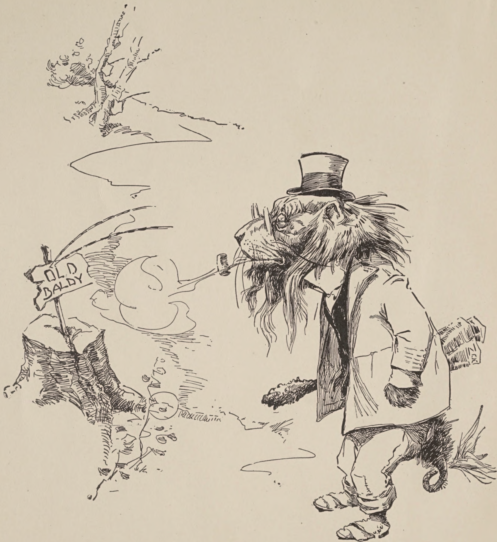
YELLOW LION FINDS HEDGEHOG'S SCRIBBLING.